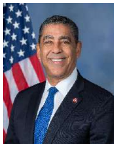
Adriano Espaillat United States Congress