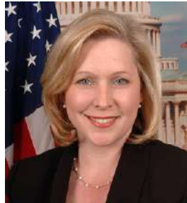
Kirsten Gillibrand United States Senator

A handwritten signature in blue ink that reads "Kirsten Gillibrand". The signature is fluid and cursive.