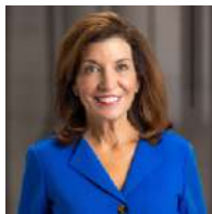
KATHY HOCHUL GOVERNOR